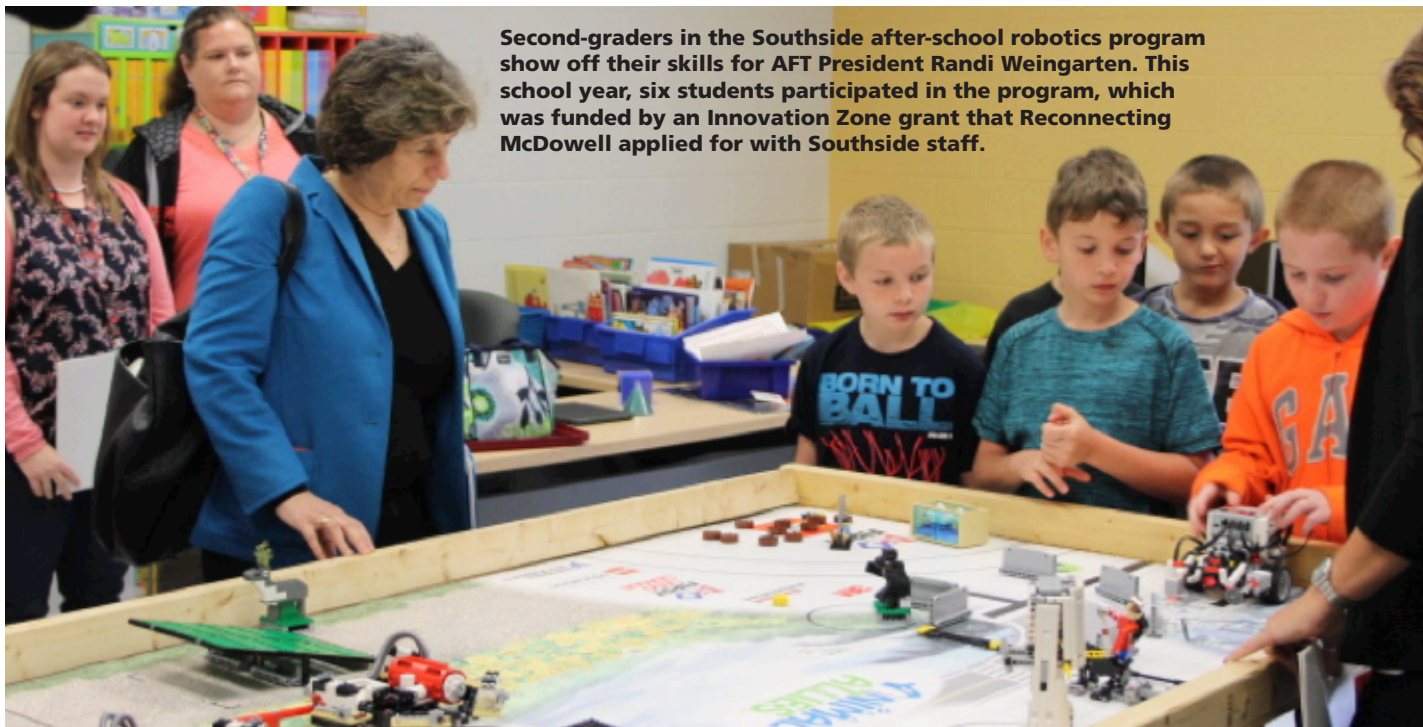
Second-graders in the Southside after-school robotics program show off their skills for AFT President Randi Weingarten. This school year, six students participated in the program, which was funded by an Innovation Zone grant that Reconnecting McDowell applied for with Southside staff.

◀ Reconnecting McDowell board members and staff participate in an after-school gentle yoga class that West Virginia University Extension offers third-graders at Southside.