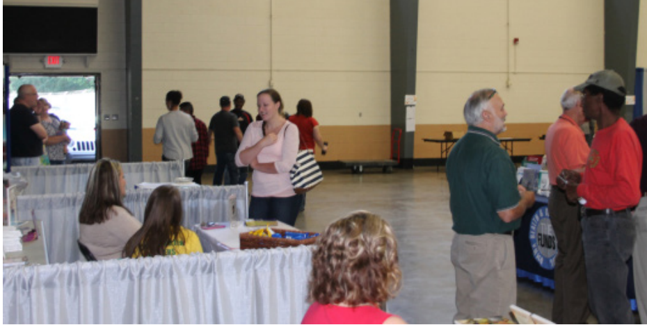
◀ The McDowell County Expo showcased a variety of community organizations.